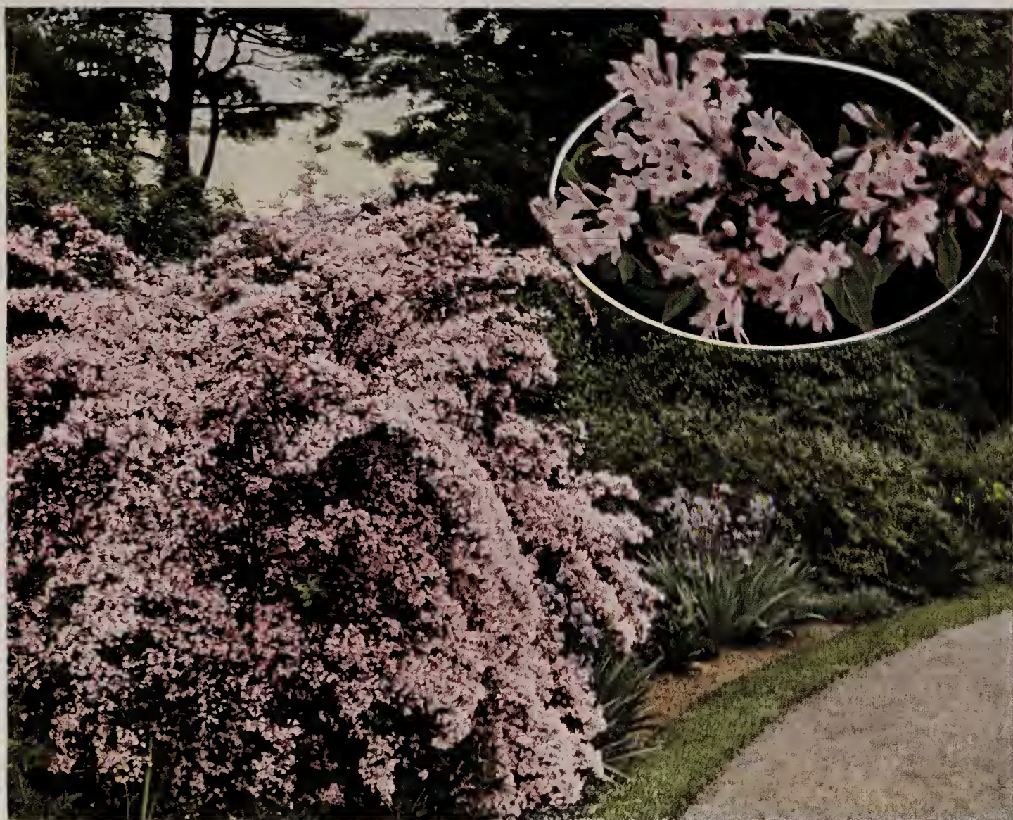
BEAUTY BUSH (KOLKWITZIA AMABILIS) The Wonderful Shrub. 25 cts. to $2.00 each, according to size. See page 6